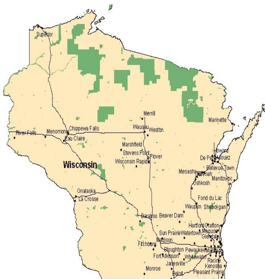
Figure 1. State of Wisconsin

The list of MSAs in the United States is published by the Office of Management and Budget. MSAs are aggregations of counties grouped together according to commuting patterns.